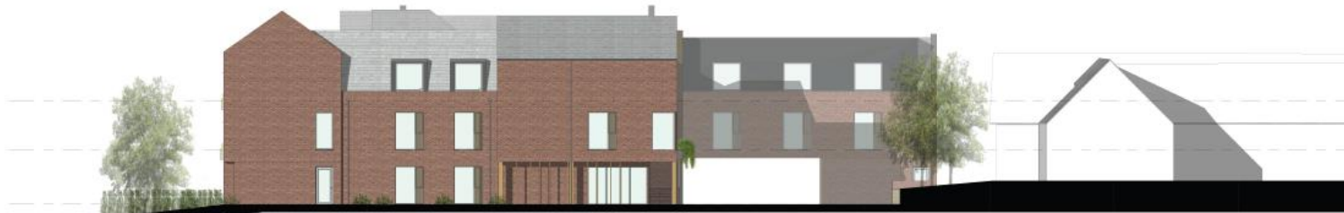
3 East Elevation 1:100