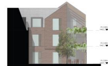
5 Courtyard Elevation 1:100