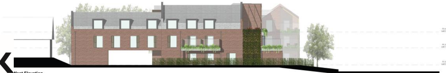
West Elevation 1:100