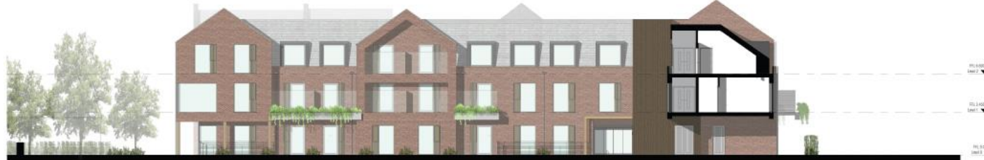
1 North Elevation 1:100