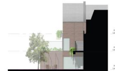
6 Courtyard Elevation 1:100