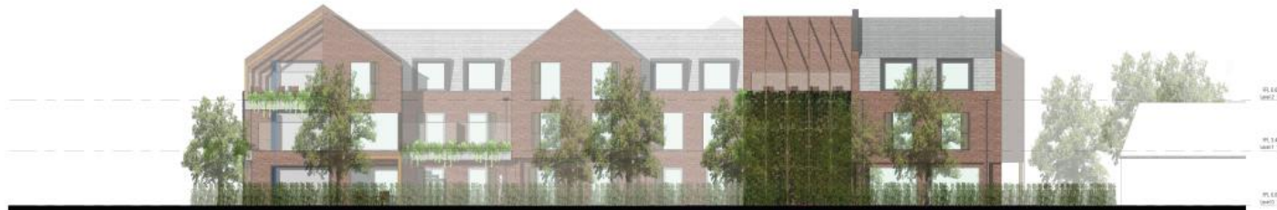
2 South Elevation 1:100